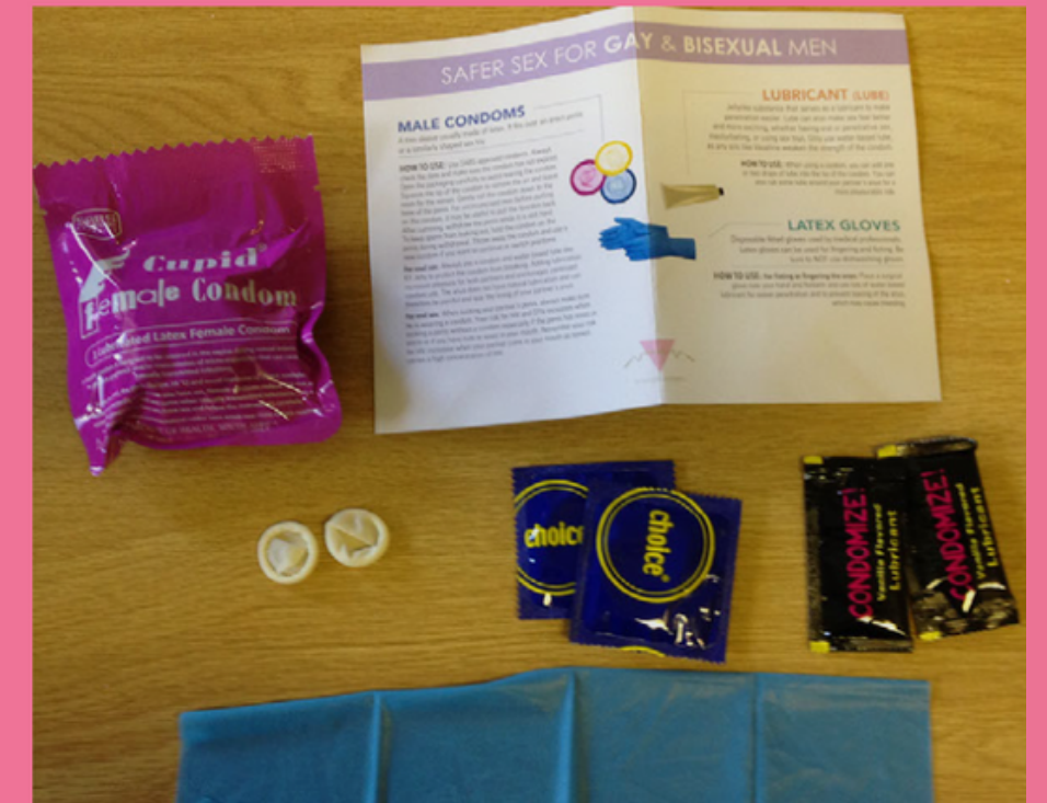
Safer sex materials and information distributed by Triangle Project

UNIVERSAL HEALTH WOULD MEAN A PUBLIC HEALTH SYSTEM, WHICH IS CAPABLE TO CATER TO EVERY PERSON, WITH THEIR SPECIFIC NEEDS, WITHOUT REGARD FOR COSTS, THAT SPECIFICALLY FOCUSES ON PRIMARY HEALTHCARE