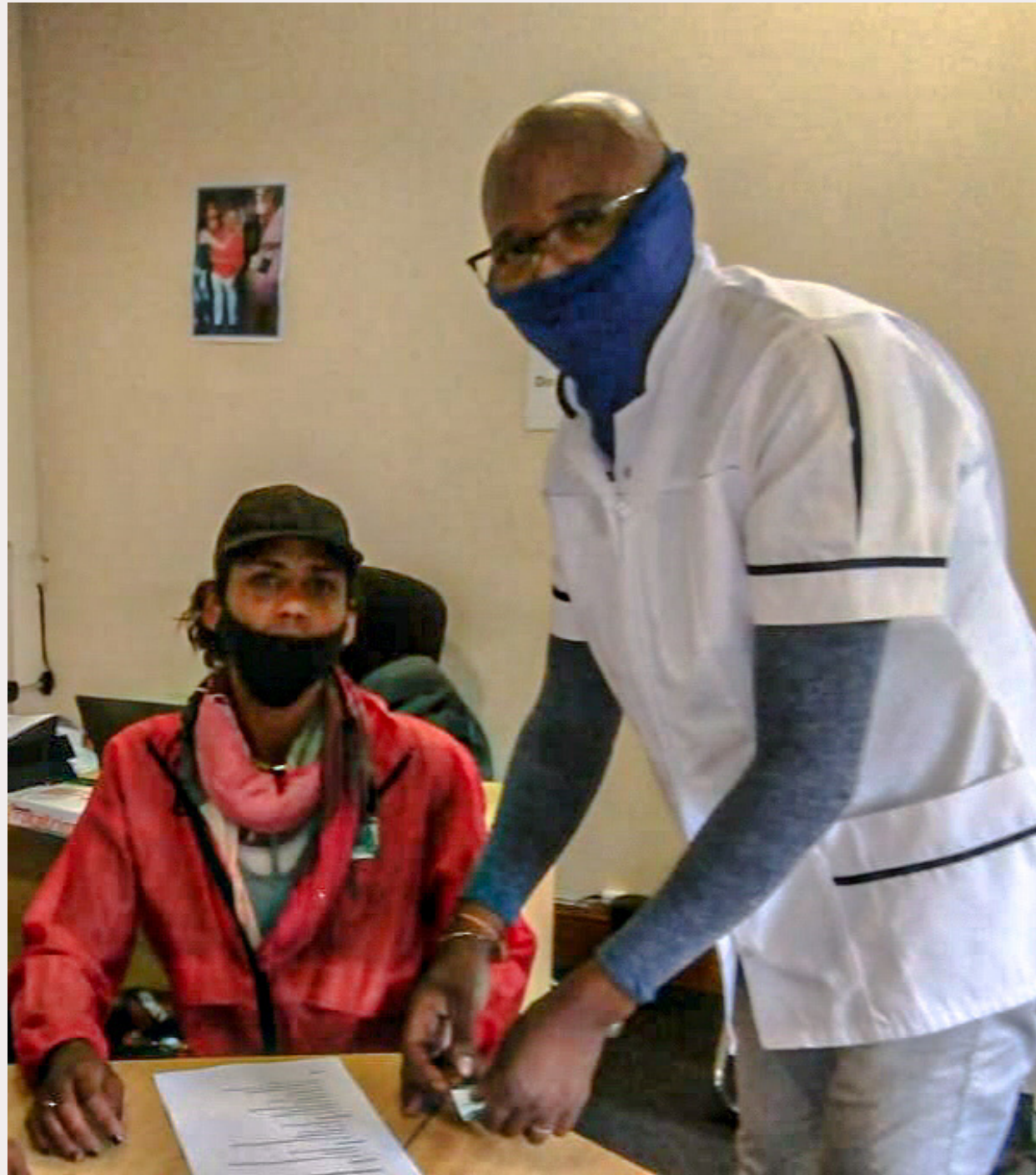
Triangle Project Clinic